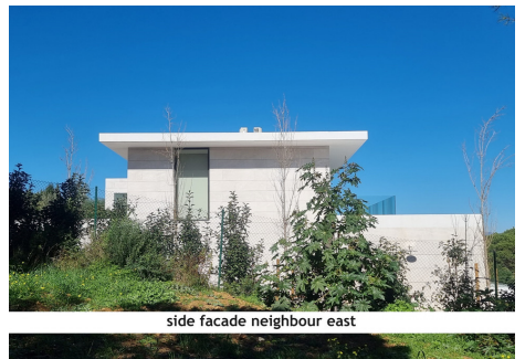
side facade neighbour east