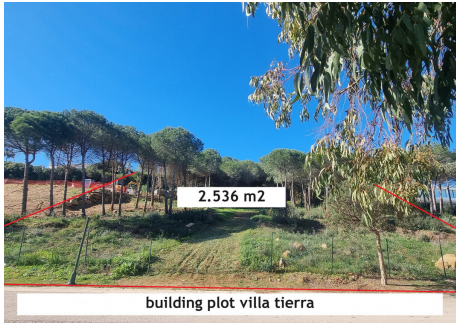
building plot villa tierra