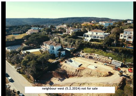
neighbour west (5.2.2024) not for sale