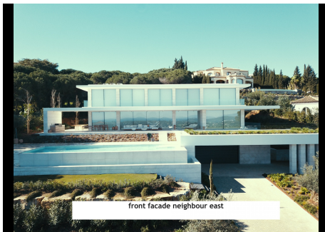
front facade neighbour east