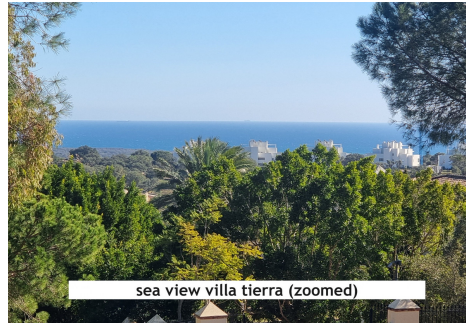
sea view villa tierra (zoomed)