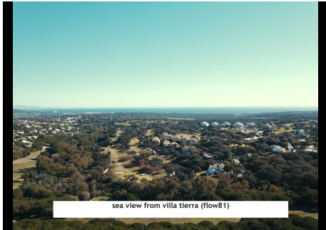
sea view from villa tierra (flow81)