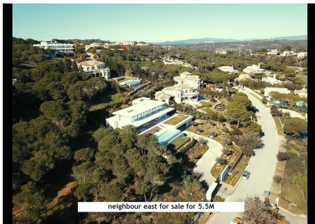
neighbour east for sale for 5.5M